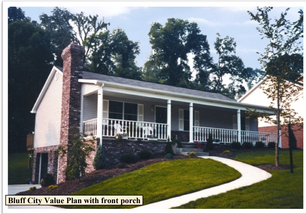
Bluff City Value Plan with front porch